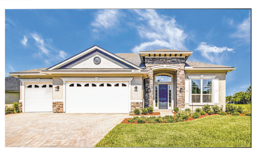
The Almeria model home from SEDA features a third-car garage and second-floor bonus room with kitchenette. (Special for Homes)