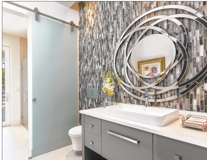
The design aesthetic – starkly modern yet warm and welcoming – extends throughout the home, with clean lines and walls of glass for abundant natural light.