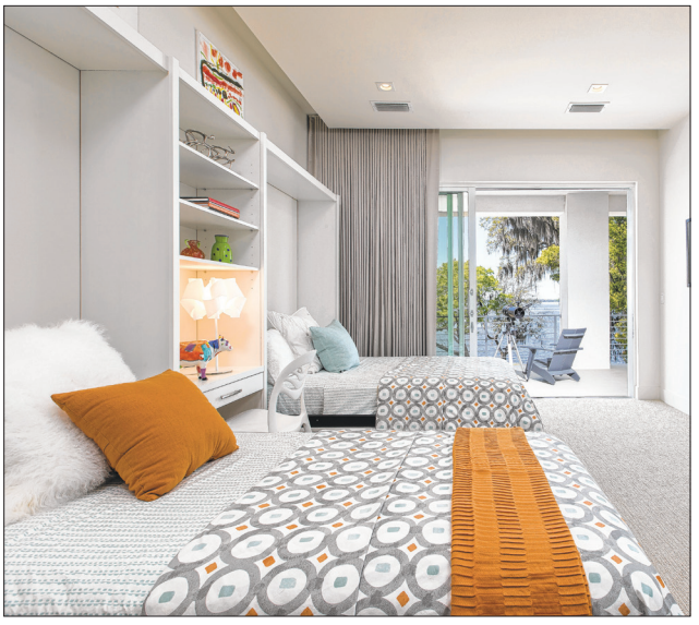
The 4,300-square-foot home is situated at the end of University Boulevard, making expansive views of the St. Johns River visible from just about every room in the house.