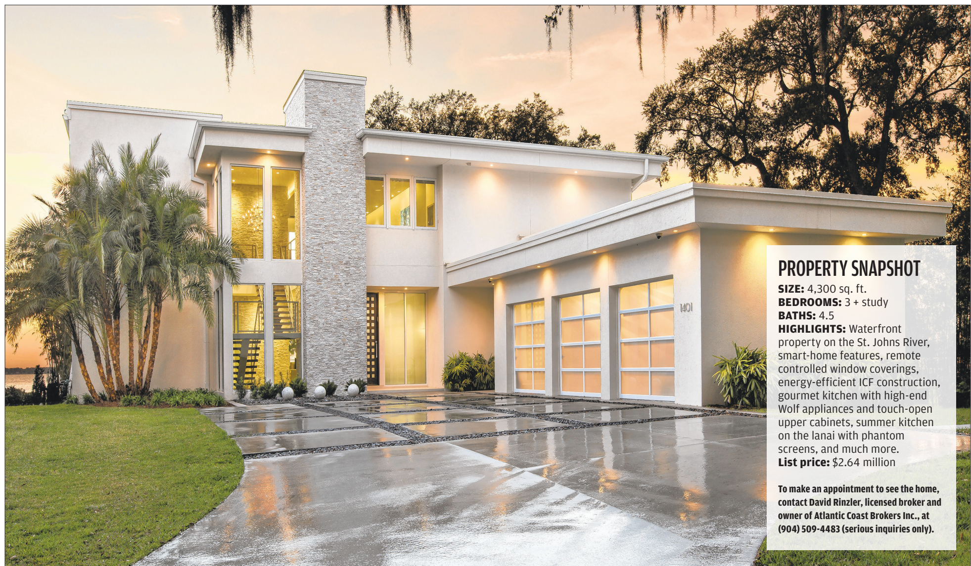
Clean lines and walls of glass bring views the property's natural beauty inside this home built by Browdy & Browdy and Phil Kean Design Group.